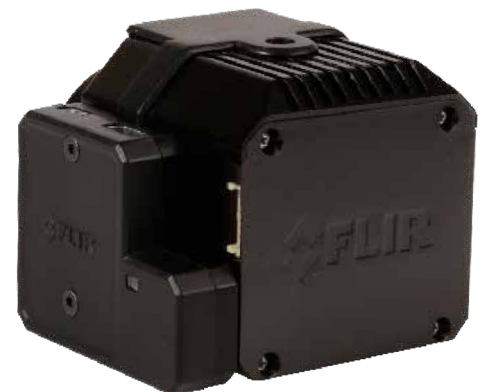
Vue Pro R with Power/Video Module attached